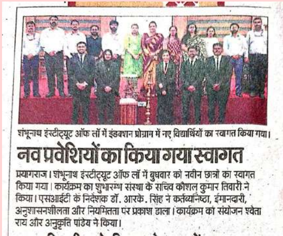
शंभूनाथ इंस्टीट्यूट ऑफ लॉ में इंडक्शन प्रोग्राम में नए विद्यार्थियों का स्वागत किया गया।